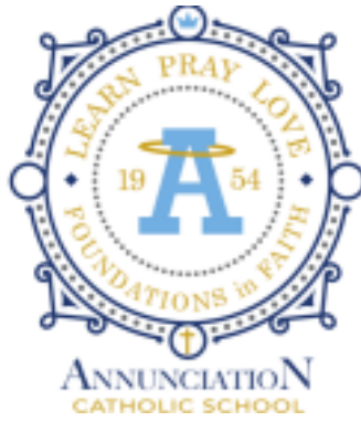
Photo and Video Release Form

I hereby give permission for my son/daughter _____ son/daughter _____ son/daughter _____ son/daughter _____